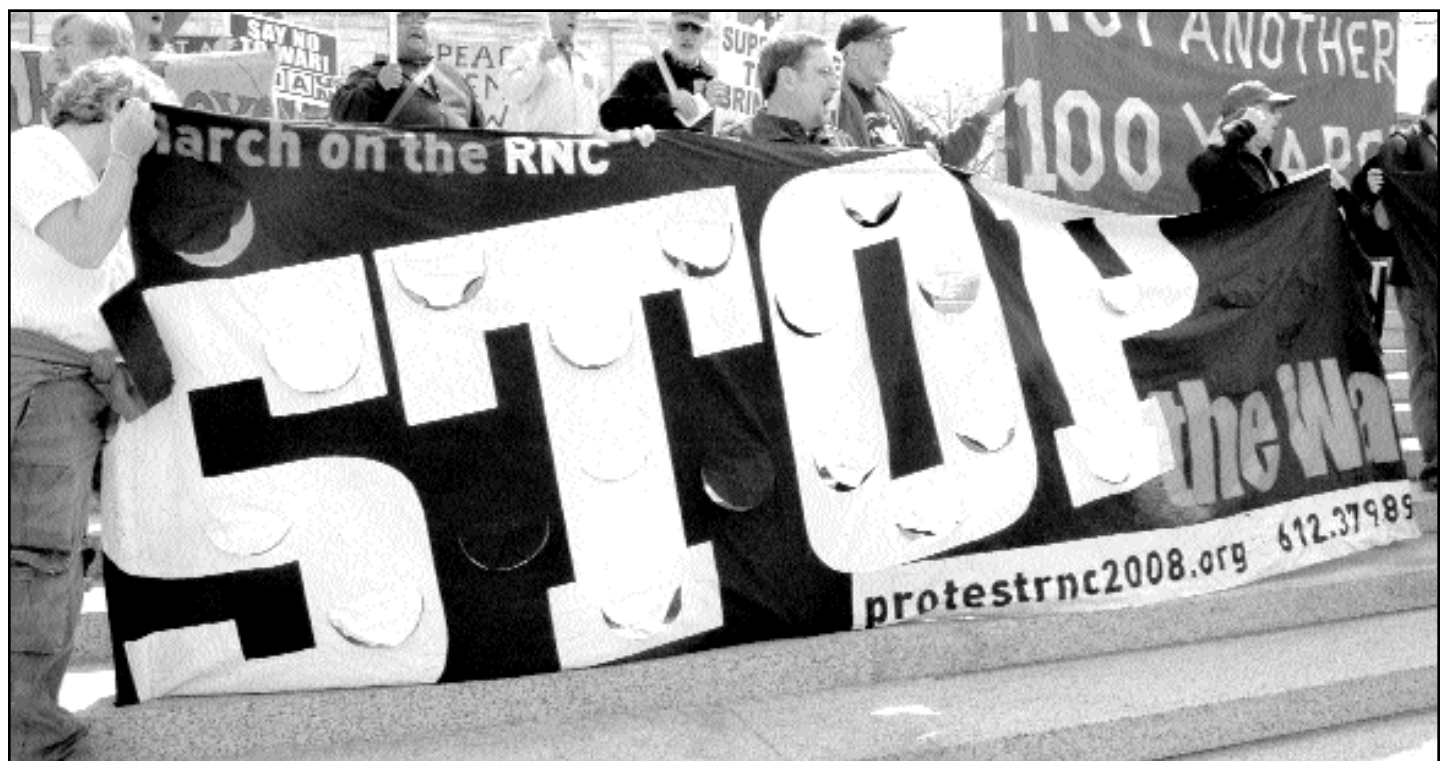
Sept. 1 will mark the first day of protests to stop the war and oppose the Republican agenda. www.protestrnc2008.org has information on all four days of action.

Our voices will be heard loud and clear on the streets when Bush addresses the RNC convention Monday night. We think the March on the RNC Sept. 1, along with all the other protests, will help to defeat McCain and make him a footnote in high school history books. We will march with you and tens of thousands of others. We will make history. Our protests will be the front-page photo in many newspapers around the world. The Republicans came to Saint Paul to hide from the American people, but